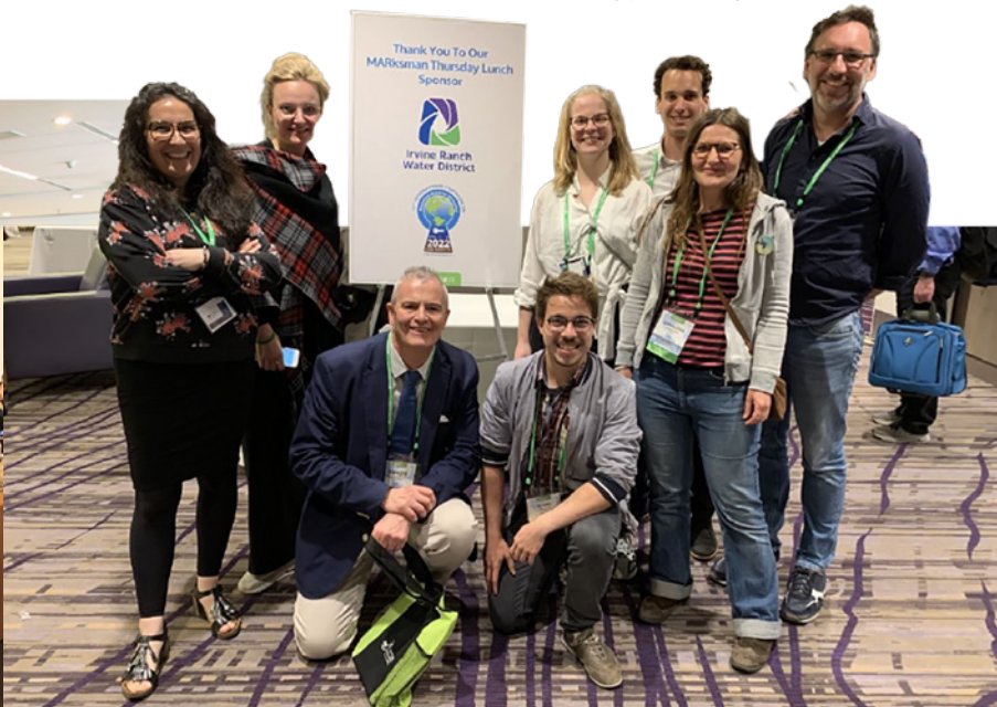
Previous IMAR Conferences