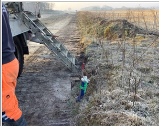
Before Sealing Photo