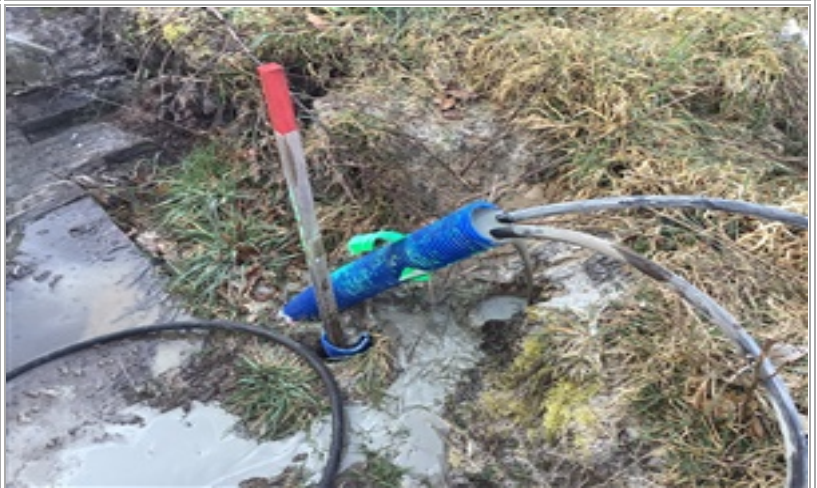
After Sealing Photo