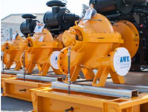
INTERNALLY COATED CHEMICAL CLEANING PUMPS