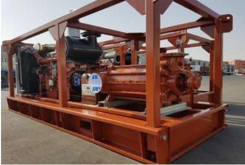
PIPELINE PRE-COMMISSIONING MULTISTAGE PUMPS