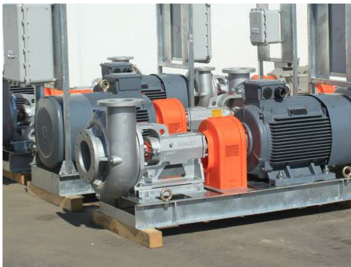
MUD TRANSFER/CIRCULATION PUMPS WITH ELECTRIC MOTOR