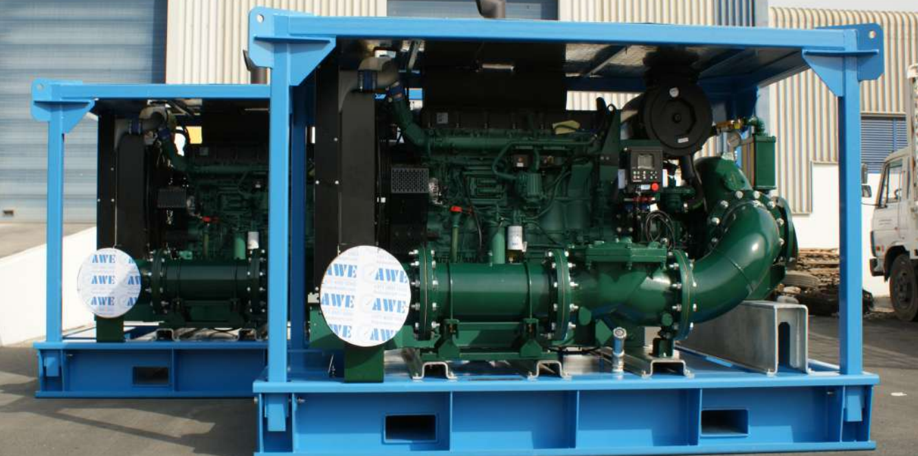
HIGH VOLUME STORM WATER DRAINAGE PUMPS.