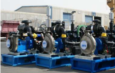
STAINLESS STEEL CHEMICAL FLUSHING PUMPS