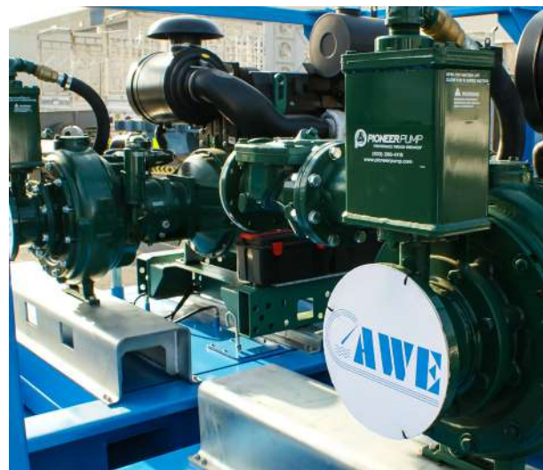
SEWAGE HANDLING AUTO DRY-PRIME PUMPS