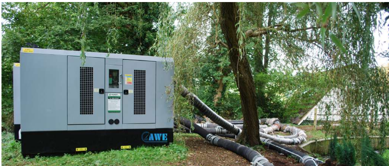
SOUND ATTENUATED CANOPY PUMPS